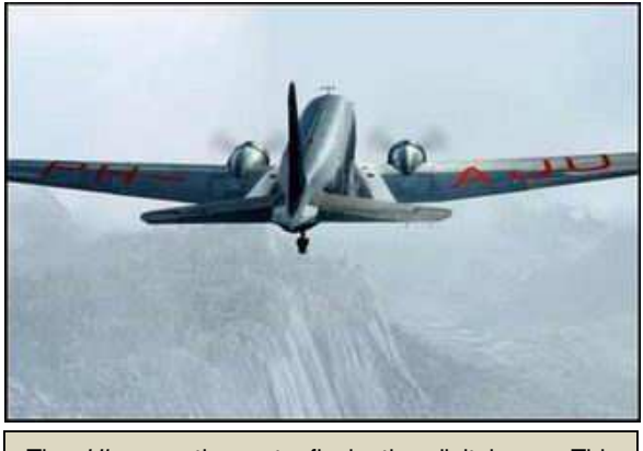
The Uiver continues to fly in the digital age. This screen shot was taken during by a digital Uiver using a Microsoft's flight simulator during a flight..

The Uiver and its famous flights are available in a virtual sense, as well. Using recent versions of Miscrosoft's flight simulators, anyone can become a virtual Uiver pilot and fly anywhere in the world. You can "sit" in the left hand seat in the cockpit and see photo-realistic views of the instrument panel and controls, as well as the terrain that you "fly" over.