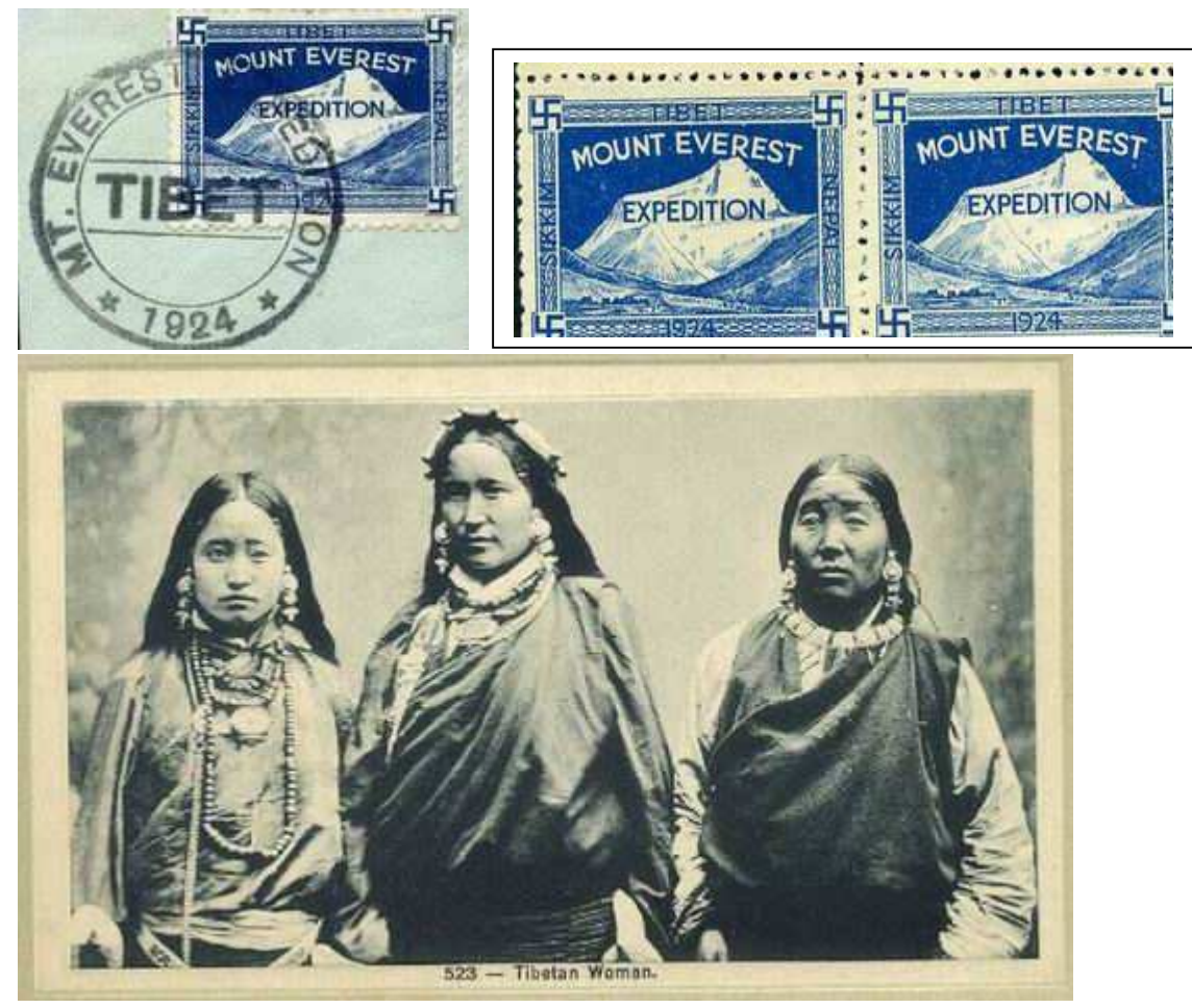
(\rightarrow to be continued in the next issue)

Since the 1920s the climbing of Mount Everest has fascinated people all over the world. Covers from the early Himalayan Expeditions and flights over Everest are prized by both Tibet and Nepal collectors as are covers relating to the more modern climbing expeditions to the "Roof of the World". Below is a canceled stamp of EVEREST: 1924 Deep Blue Everest Expedition Label tied to piece by MT. EVEREST EXPEDITION / TIBET / 1924 cancel (Waterfall Type IIb (Hel. Type E1). This scarce cancel was used on mail sent from Tibet. VF Condition.