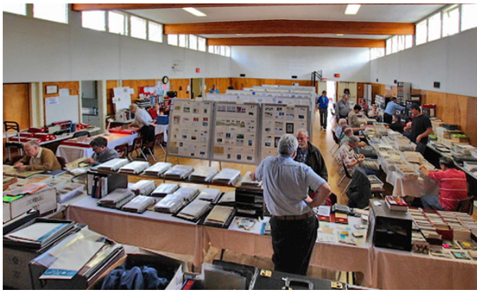
VANPEX 2013, Sept. 20-21 at West Burnaby United Church.