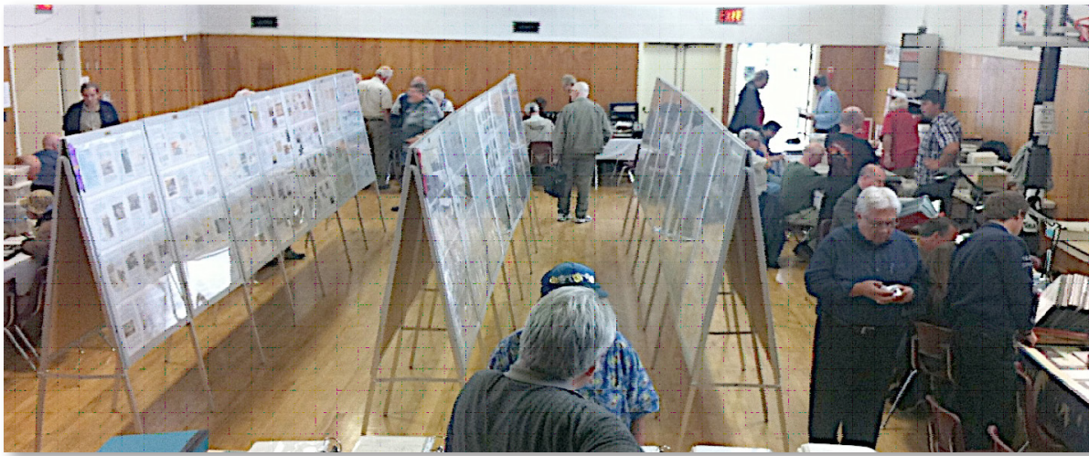
◀ A TYPICAL VANPEX 2013 SCENE: BC Phil members and guests congregate at bourse tables. Stamp dealers normally get more attention than exhibits, but a good many bourse purchases end up in exhibit frames at future exhibitions.