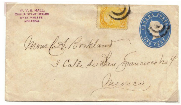
Montrool to Mourice City

usage On envelopes is also interest. of Precancelled and special envelopes for elections form a specialized interest. Companies with large volume could mailings